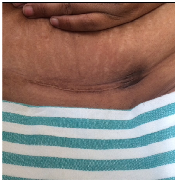
Fig 1. Caesarean Section scar

A 30 year old Para 5, living 3, dead 2 underwent lower section caesarean section 2 years back presented to gynecology out patient department with complaints of pain in caesarean scar site from 1 year. The pain aggravated during the menstrual periods. A firm and tender swelling of dark brown color measuring 2×2 cm was found at the left edge of the caesarean scar and was not fixed to the rectus sheath.